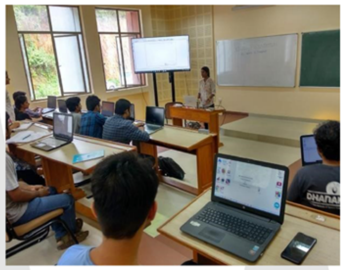
PCB Designing using KiCAD

projects. It also included a hands-on session on KiCad Software. A total of 16 participants took part in the workshop.