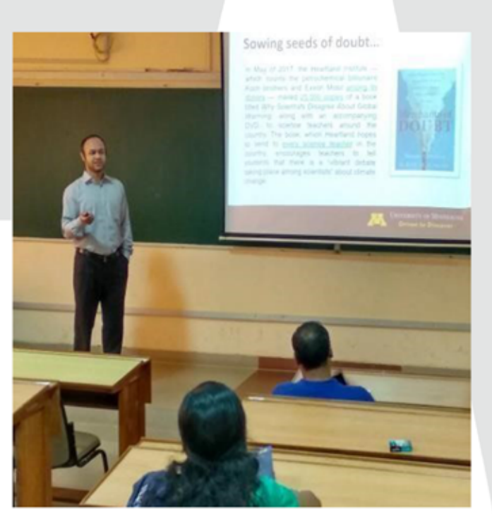
Renewable rich Grid-Applications and Challenges

The IEEE IAS SB Chapter IIST organized an expert talk on the topic 'Power Electronics for a Renewable rich Grid-Applications and Challenges' on 17th December 2018. The talk delivered the aspects of solar and wind energy power systems for reducing the carbon footprint and discussed the Modular Multilevel Converter (MMC) based converter topologies used for utility. The talk also covered the challenges the utility might face with the rising penetration of renewables. A total of 20 participants attended the program.