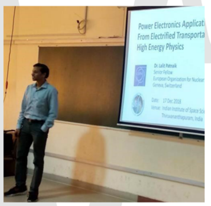
Applications – From Electrified Transportation to High Energy Physics

On 17th December 2018, the IEEE IAS SB Chapter IIST organized a talk on the topic 'Power electronics applicationsfrom electrified transportation to high energy physics'. The talk summarized ideas and results from four different projects covering diverse application areas of power electronic systems. The talk was followed by an interactive session with the audience. A total of 20 participants attended the program.