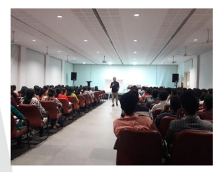
Workshop on Resume Writing

A workshop on 'Resume writing and profile building' was organized by IETE Students Forum TKMCE in association with IEEE IAS SB Chapter TKMCE on 7th November 2018. The aim of the workshop was to introduce the students to the proper way of representing themselves in a resume and help them achieve a state where they are not rejected by a poor resume. The workshop was attended by 64 students.