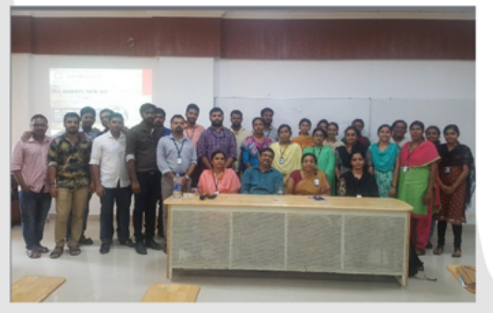
Workshop on IoT

With the joint coordination of IEEE IA/IE/-PELS Jt. Chapter of Kerala Section along with IEDC unit of Musaliar College of Engineering conducted a workshop on IoT during 9th and 11th of March 2018. The idea behind the event was to have a workshop with 80 per cent hands-on training so as to create a more deeply grounded knowledge on IoT. A total of 45 students from different departments participated in the workshop.