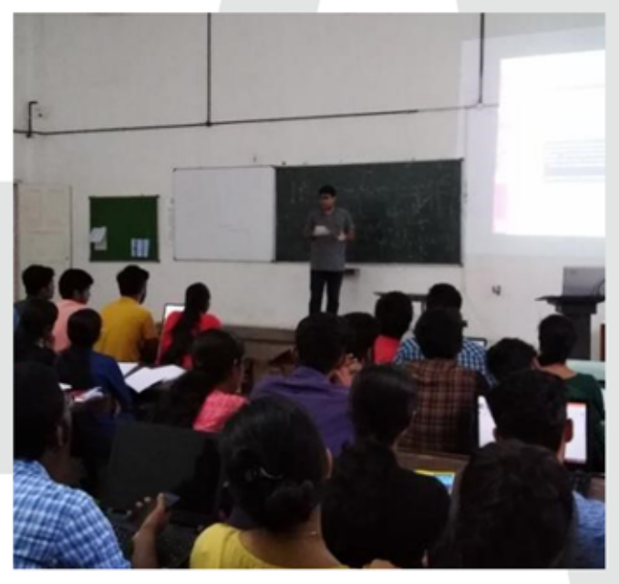
SIGAI at TKMCE

On 8th October 2018, the IEEE IAS SB Chapter TKMCE conducted the second session of SIG AI. The session introduced the students to the statistical approach of exploratory data analysis for summarizing data. The session made the students reach a new level of understanding AI. The session was attended by more than 50 students.