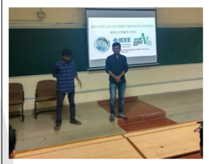
Workshop at IIST

As part of celebrating the IEEE Day, the IEEE SB IIST in association with IEEE IAS SB Chapter IIST conducted a workshop on the topic 'Characterization and Control of DC Drives' on 2nd October 2018. The workshop began with a briefing about the importance of IEEE in the context of IEEE Day. A total of 31 students participated in the workshop.