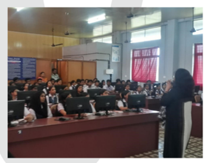
Seminar on Opportunities Abroad

On 8th November 2018, the IEEE IAS SB Chapter VJEC organized a seminar on opportunities abroad. The seminar was conducted by Santa Monica. The session comprised of the stay back policies and government scholarships offered by different countries. A total of more than 60 students attended the session.