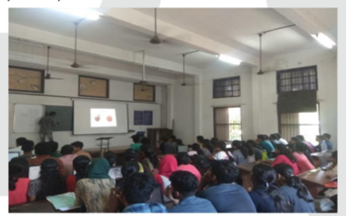
Class on Introduction to AI

SIG AI was introduced as a combined endeavour of IEEE IAS SB Chapter and IEDC unit of TKMCE. It was introduced to let the students understand the new opportunities in AI and IoT and give them more insight into the concepts and ideas of machine learning. The class was conducted on 6th August 2018 with a total participation of 40 members.