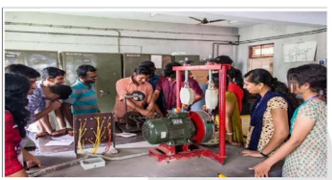
EE ISQIP Industrial Visit

The IA/IE/PELS Jt. Chapter Kerala Section and IEEE IAS SB Chapter Musaliar Engineering College jointly organized an Industrial Visit to Travancore Titanium Products Ltd, Thiruvananthapuram on 11th July 2018. The Engineers of the company thoroughly explained the operations of the company. A total of 56 students and 3 faculty members participated in the IV.