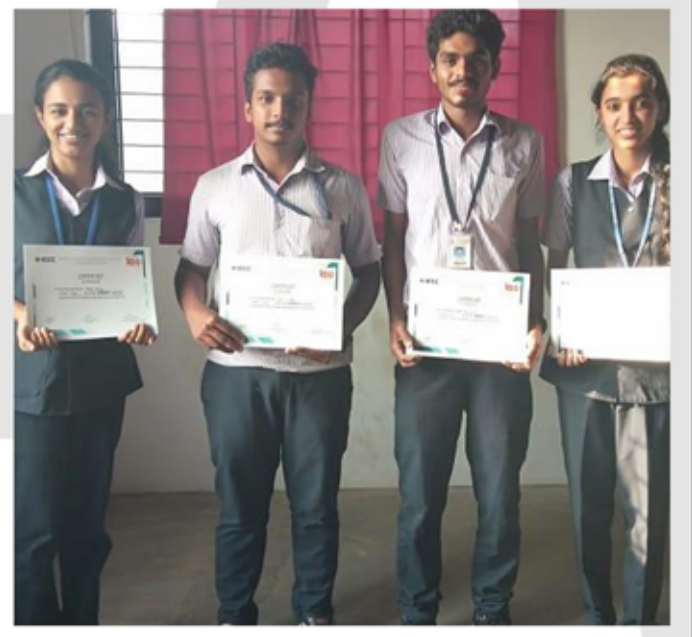
INNOVATE at Vimal Jyothi

As part of the celebration of Engineer's Day, the IEEE SB VJEC in coordination with IEEE IAS SB Chapter VJEC conducted a technical topic presentation competition called 'INNOVATE' on 26th September 2018. The aim of the competition was to improve the speaking skills along with a platform to present their innovative idea. A total of 20 participants took part in the event.