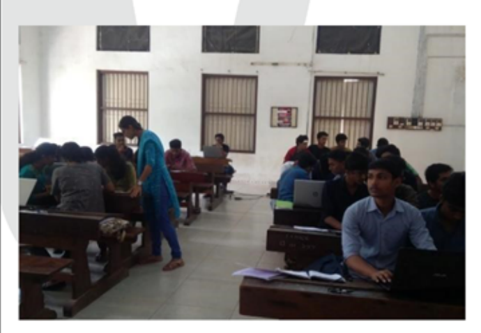
SIGIoT at TKMCE

Internet of Things is expanding at a rapid rate and it is important for both students and young professionals to know what it is and how it works. In order to put some light into it, the IEEE IAS SB Chapter TKMCE conducted a session on SIG IoT on 7th October 2018. The class gave them an insight into IoT and its concepts. A total of 38 students participated in the session.