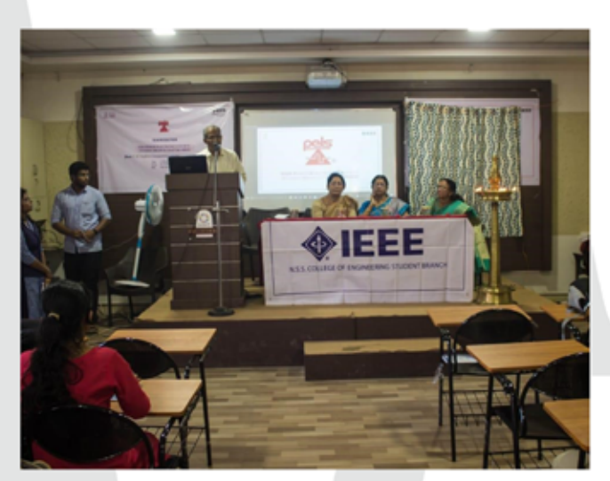
Inauguration of IEEE PELS SB Chapter

On 15th November 2018, the inauguration of IEEE PELS SB NSSCE Chapter took place. This chapter is the first PELS chapter in Kerala Section. A session based on the 'History of Power Electronics' was done. This inauguration created a history in the journey of the IEEE SB NSSCE. The function was attended by more than 75 students.