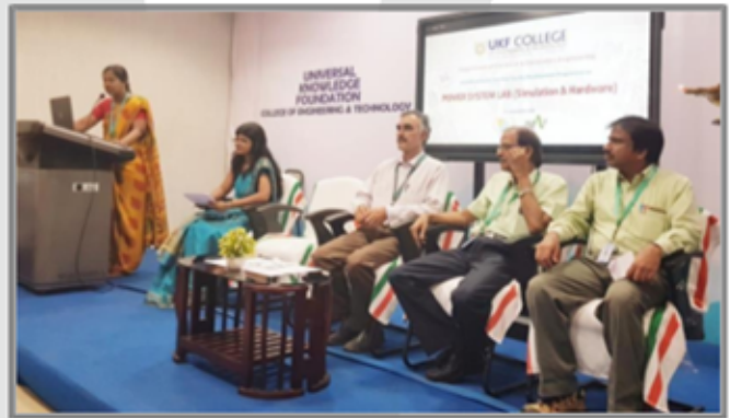
Faculty Development Programme

Workshop on 'Making LED Bulb' Faculty Development Programme at UKFCET