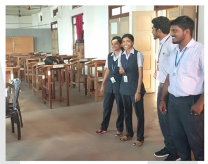
Debate Competition at Vimal Jyothi

Several teams participated in this competition. The aim of the competition was to improve the language skills of the stu-