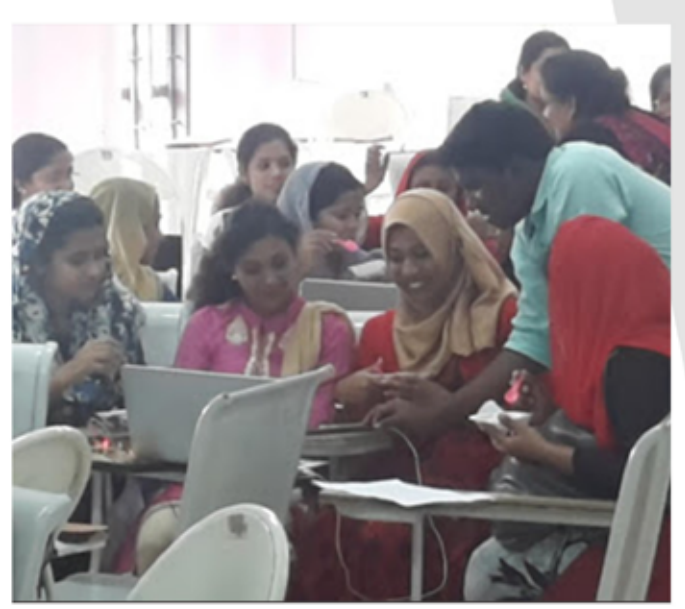
Women's Day Celebration at CEK

As a part of women's day celebrations, the IEEE SB and IEEE IAS SB Chapter of CEK in association with IEEE WIE AG conducted a two-day long event on 8th and 9th of March 2018. The event had talks on the topic 'Health and personal hygiene' and conducted a quiz in order to make the students aware about the situations faced by the women in the world. The event gathered around 60 students and the WIE Kit was distributed to all the IEEE Members.