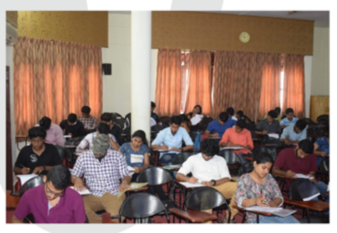
Quiz Competition 'TECH-Q'

On 2nd October 2018, the IEEE IAS SB Chapter conducted a technical quiz competition called 'Tech-Q' as part of IEEE Day celebrations. A total of 49 students participated from various departments of the college. The questions were included from aptitude, technical and general category. The aim was to make the students understand the importance of IEEE Day and values that IEEE tries to generate in you.