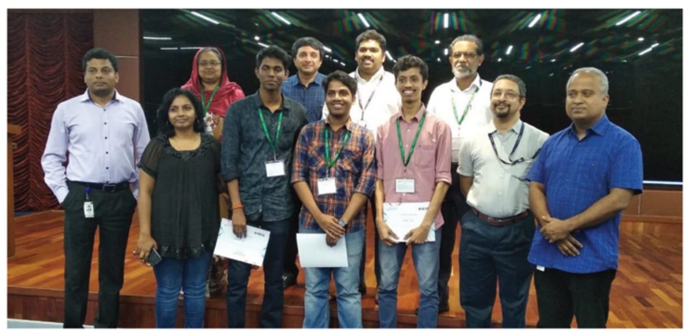
The winners of UST Global Coding Contest 2018